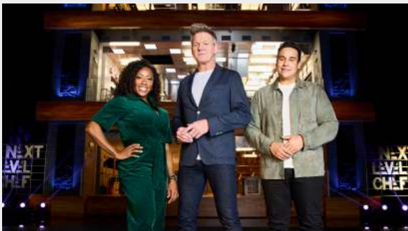
Next Level Chef Wednesday, 9pm 1st February ITV1