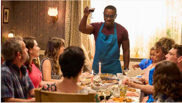
The Family Pile Tuesday, 9.30pm 31st January ITV1

Now the buyers' offer has been accepted, it's time to say goodbye to the house in the comedy-drama about one of life's big milestones - selling your parents' home.