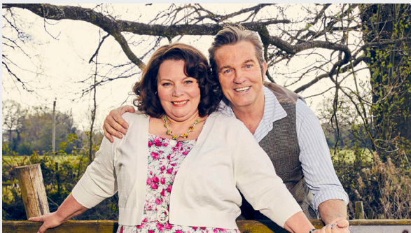
The Larkins Sunday, 8.05pm 30th July ITV3

We're kicking things off with the first ever episode of Where The Heart Is , before heading over to The Royal . As the day progresses, expect Heartbeat , and a trip to see our friends in Emmerdale . A Touch of Frost completes the viewing into the evening.