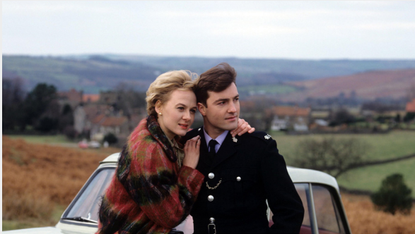
Yorkshire Day Tuesday, from 8.05am 1st August ITV3

It's a celebration of all things Yorkshire on ITV3 today - featuring some of our favourite episodes of some of the best programmes to come from the county.