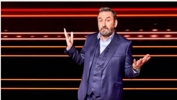
The 1% Club Saturday, 8.30pm 30th March ITV1