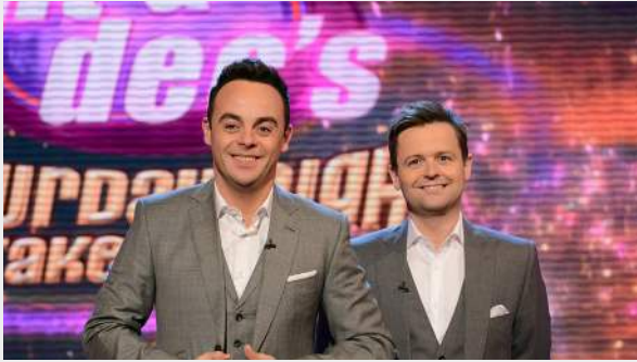
Ant & Dec's Saturday Night Takeaway Saturday, 7pm 30th March ITV1

Ant & Dec present the popular entertainment show where one member of the studio audience can win all of the products advertised during an ad break in the past week.