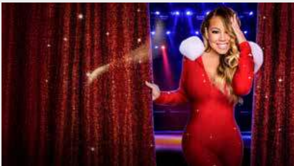
Mariah Carey: Merry Christmas to All Sunday, 2.45pm 22nd December ITV1

Each episode features various royal expert guests - from royal newspaper editors to former Palace insiders - discussing all of the recent news surrounding the royal family together with fresh, knowledgeable and detailed insight into UK and foreign monarchies.