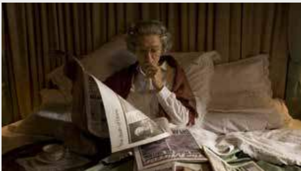
The Queen Boxing Day, 8pm 26th December ITV3

In this 2023 Christmas special, the suspicious death of a disgraced television personality sees Vera's boss insist she takes the case in her old stomping ground Hily Island, where it soon becomes clear there's more to the case than meets the eye.