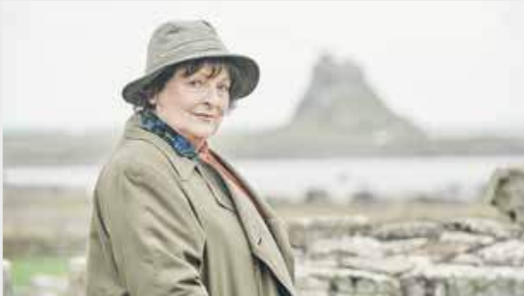
Vera Christmas Day, 9pm 25th December ITV3

Crime drama about DCI Vera Stanhope, who is obsessive about her work and tackles each new case with unparalleled gusto and professionalism with her colleagues.