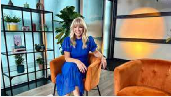
The Royal Beat Sunday, 12.30pm 22nd December ITV1

Kate Thornton presents the programme that takes us to the heart of royal matters and dissects the latest news about the monarchy with expert guests and analysis.