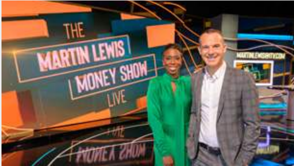
The Martin Lewis Money Show Live Tuesday, 8pm 19th May ITV1

Consumer champion Martin Lewis continues his quest to save the public a fortune by revealing more money-saving tips, budgeting advice, and shopping secrets.