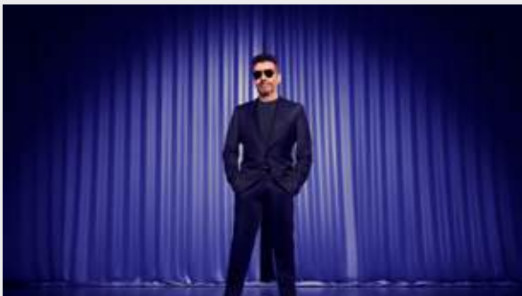
Britain's Got Talent Sunday, 7pm 18th May ITV1