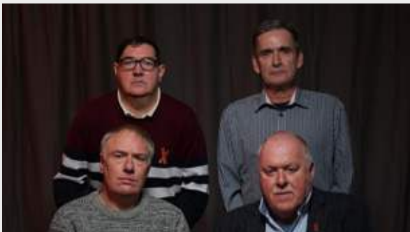
The British Blood Scandal: Poisoned at School Tuesday, 9pm 19th May ITV1