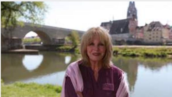
Joanna Lumley's Danube Friday, 9pm 23rd May ITV1

Seven players are left standing to take on the next Main Match of Safari Race - in this game, the contestants must back the winning animals in a race to gain points. As they realise they must play a social and strategic game, who will thrive and who will perish?