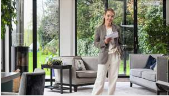
Katie Piper's Weekend Escape Sunday, 8.25am 18th May ITV1

Join Katie Piper and enter the space she's created as a one-stop shop for wellness needs, fitness, food, entertainment, celebrity access, community heroes and more.