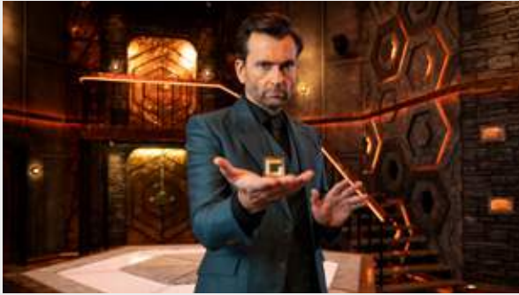
Genius Game Wednesday, 9pm 21st May ITV1