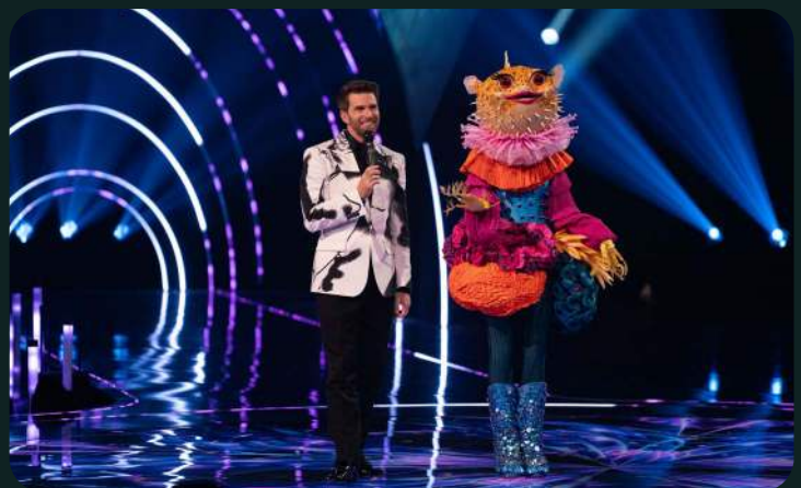
Available on ITVX