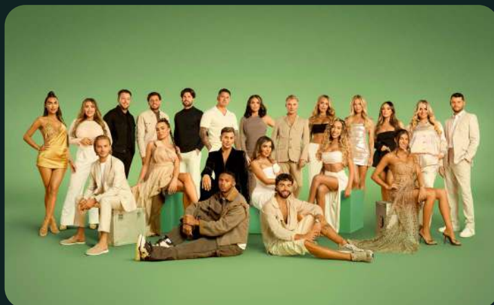
Available on ITVX