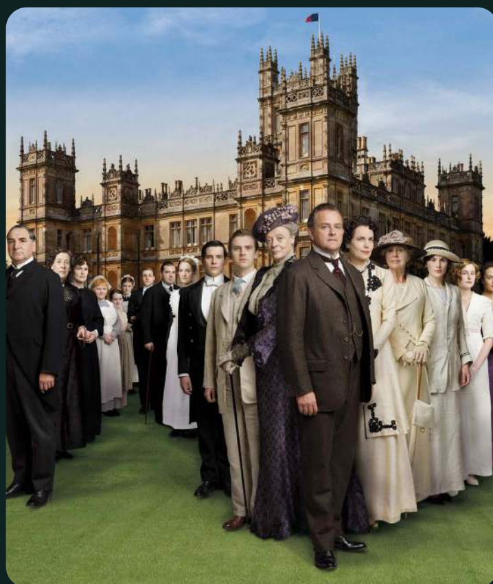
Available on ITVX © 2010 Carnival Film & Television Limited. All Rights Reserved.