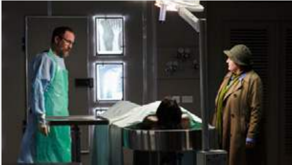
Vera Saturday, 9pm 8th November ITV3

Crime drama series following DCI Vera Stanhope, a detective who tackles every case with unparalleled gusto and professionalism alongside her trusted colleagues.