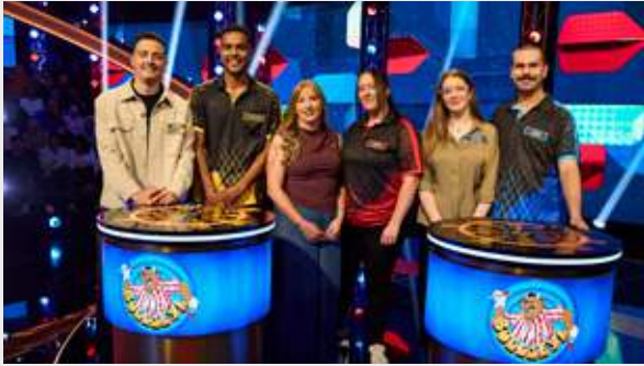
Bullseye Sunday, 8pm 9th November ITV1