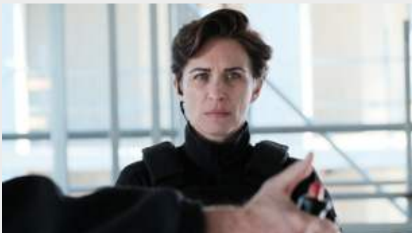
Trigger Point Sunday & Monday, 9pm 9th & 10th November ITV1

All the classic Bullseye rounds are back and the winning team will have a big decision at the end of the show - will they risk everything they've won so far to try to win Bully's Mystery Star Prize? All that plus world darts champion Luke Littler in a charity challenge!