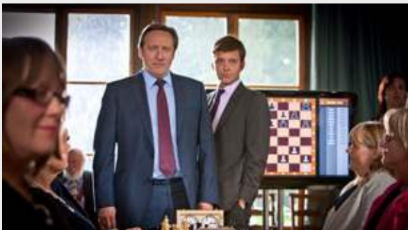
Midsomer Murders Monday, 8pm 10th November ITV3

We're back in the ninth series of the much-loved drama for this pick from the archives. This time, DCI Vera Stanhope investigates when a beauty empire is shaken to the ground after one of three sisters is found dead in the River Tyne. Can Vera crack the case?